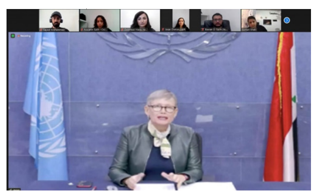
Figure 3: C4JR organized a virtual conference with the United Nations Assistance Mission for Iraq (UNAMI)

On December 8th 2020, C4JR organized a virtual conference with the United Nations Assistance Mission for Iraq (UNAMI). In addition to MPs, officials from the Iraqi executive branch participated in the conference.