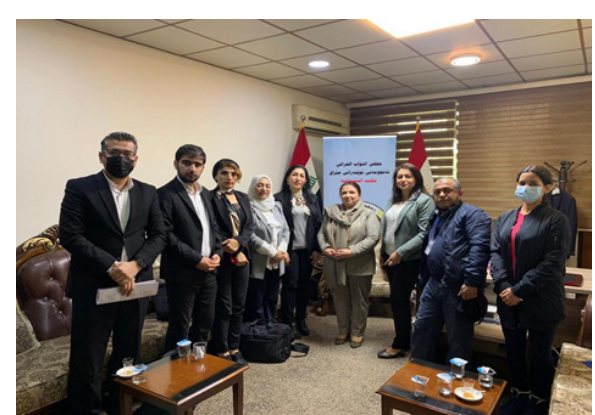
Figure 2: C4JR meet MP Saib Khidir.